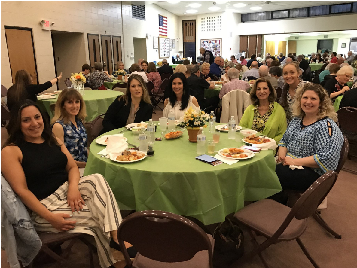
Volunteer Appreciation Party--

We celebrate our volunteers who serve our parish with selfless love and devotion. Thank you for all you do for St. Thomas More. A couple of pictures of the Volunteer Appreciation Party held on Friday, May 5, 2018.