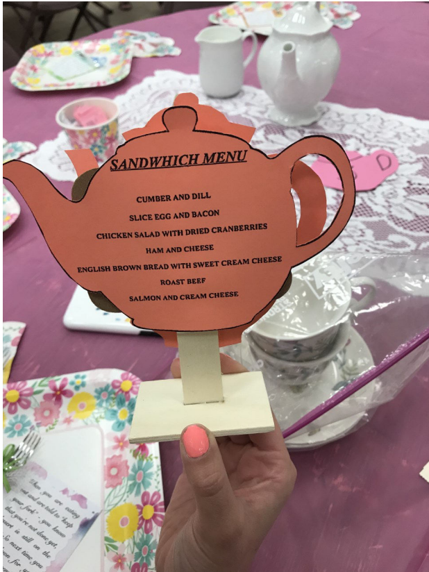
Lots of Teas, Finger Foods, & Other Goodies.