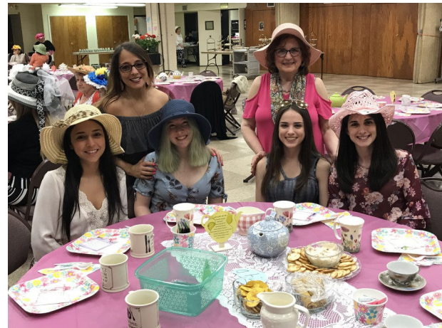
Plenty of Family & Friends