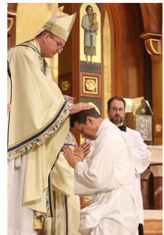
Laying On of Hands