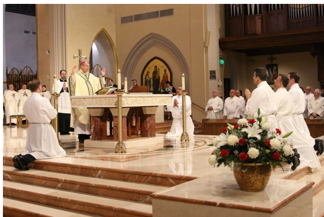
Prayer of Consecration over Candidates