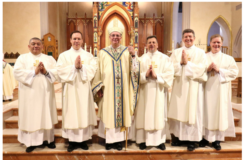
The newly ordained deacons with Bishop Barres