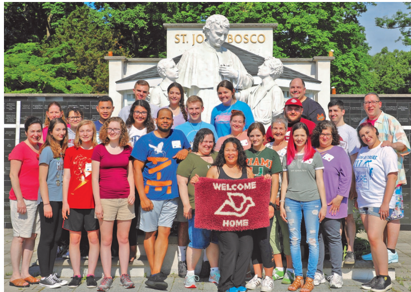
Youth Ministry Teen Retreat

Proceeds from the event benefit the retired Sisters - the beautiful and dedicated women who have spent their entire lives serving the tristate area and beyond; now it is our turn to care for them. For more information, please contact 631-842-6000 ext. 246.