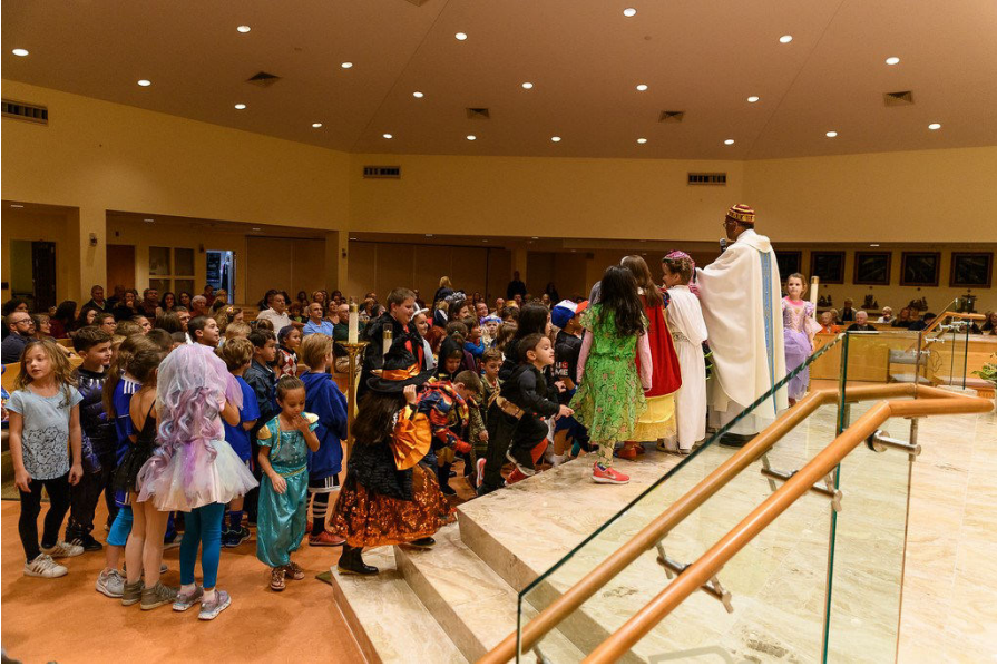
The Mass on All Saints Day at 7pm was well attended by children who came in their Halloween costumes.