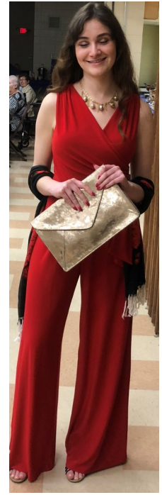
Pictures of the fund raiser Fashion Show hosted by the St. Thomas More Columbiettes on Saturday, May 18, 2019.