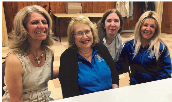
Pictured above are some Columbiettes who helped at the Pancake Breakfast.