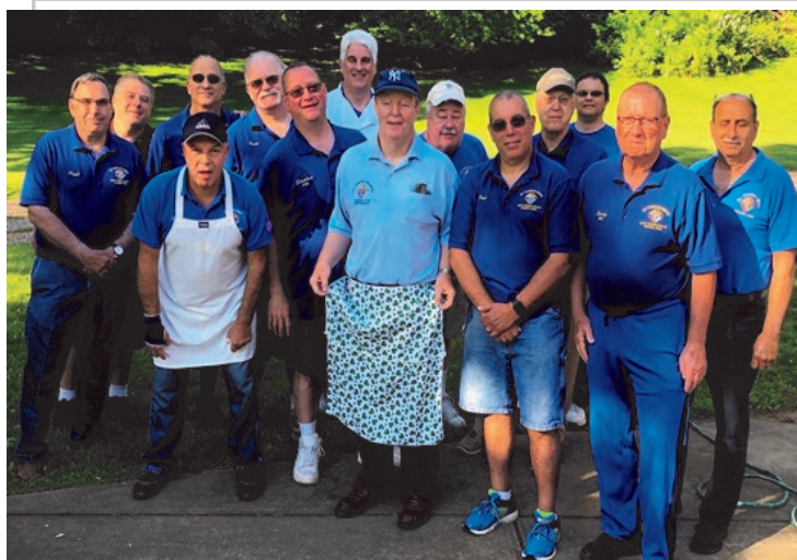
The Knights of Columbus prepared the Pancake breakfast on Sunday of the Feast Weekend—thanks guys!