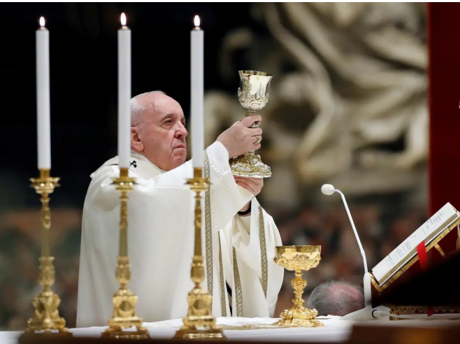
Pope Francis during Easter Vigil Mass 2020 at St. Peter's Basilica, which was virtually empty due to continuing restrictions of the coronavirus.