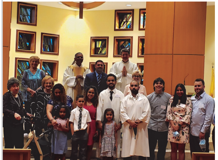
RCIA people who received sacraments plus team members