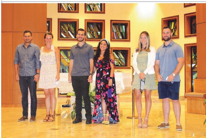
Pre- Cana couples celebrate the completion of our STM Pre-Cana program along with their parents, and our parish family at the Saturday 5:00 pm Mass.