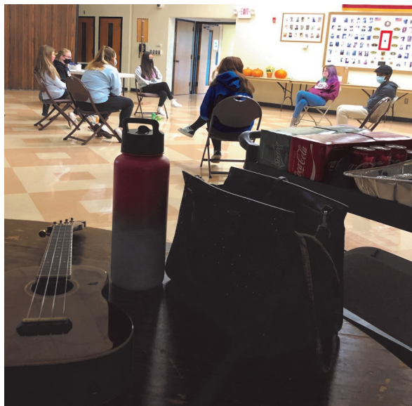
The Youth Ministry continues to meet once every two weeks. Pictured above a group of teens discussing their life issues at an Alpha gathering on Oct. 18", 2020

Would you like to receive a daily spiritual reflection or updates of what's happening in our Parish? See below or go to StThomasMore29.flocknote.com