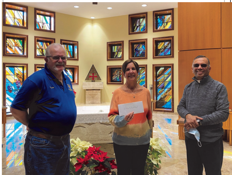
The 6062 Colombian Club was happy to make a donation to St. Thomas More Parish.