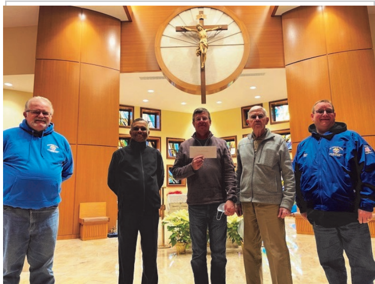
6062 Columbian Club donation to the St. Vincent DePaul Chapter at St. Thomas More Parish, Hauppauge

Please return to the Rectory for processing.