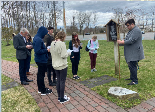
Stations of the Cross