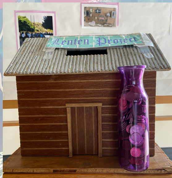
Our Contribution to the Lenten Mission