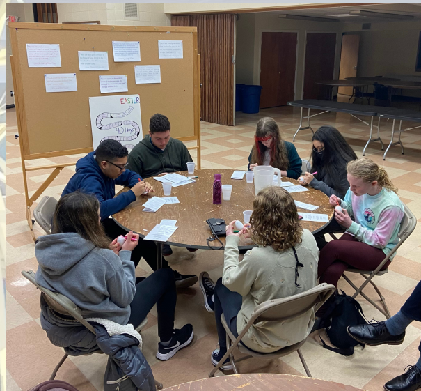
Coloring Easter Eggs