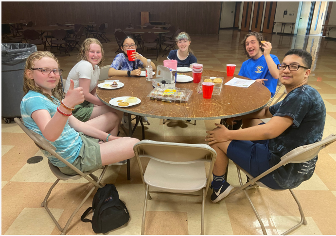
Snacks and social time.

During Lent we wrote compliments for each other on popsicle sticks. At last week's meeting we made decorations with them so we can look at them and know we're loved by our Youth Group family.