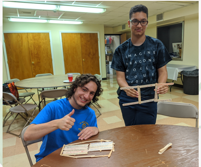
Wonderful works in progress!

During Lent we wrote compliments for each other on popsicle sticks. At last week's meeting we made decorations with them so we can look at them and know we're loved by our Youth Group family.