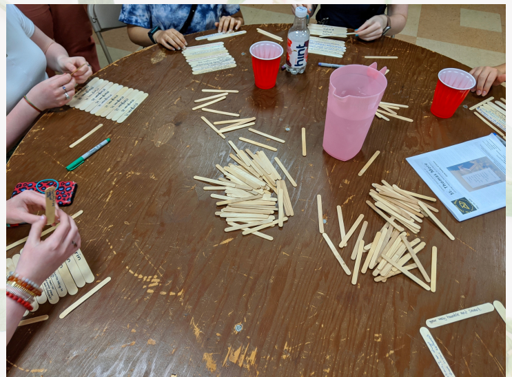
Planning our crafts