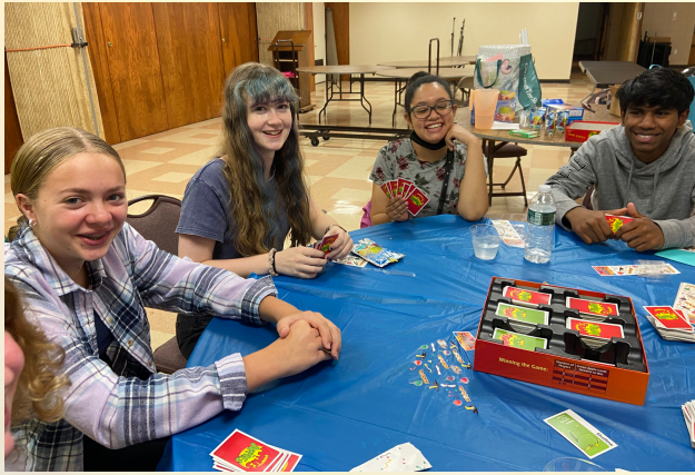
Playing Apples to Apples