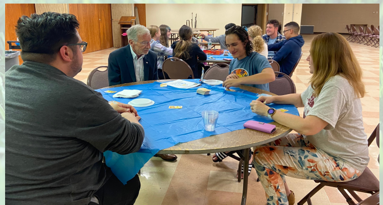
Adults playing Uno!