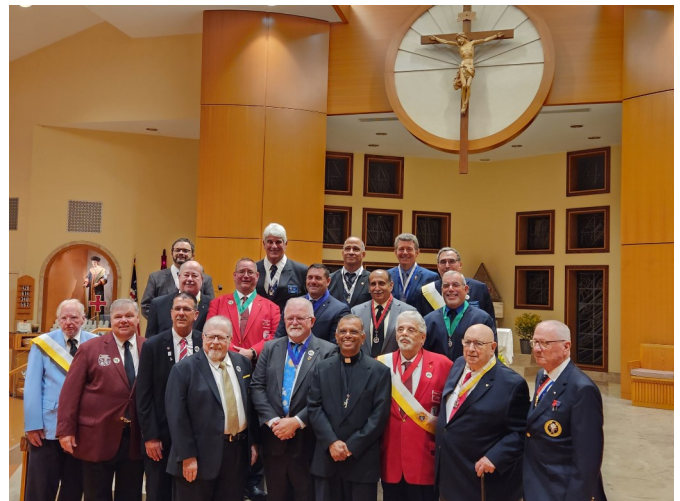
Knights of Columbus Council 6062 Installation of Officers September 17, 2022