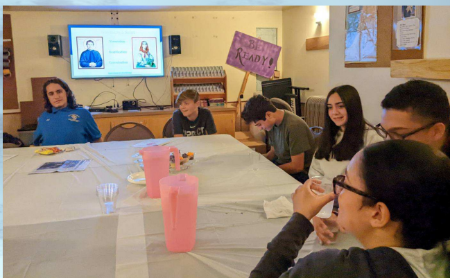
Learning about Saints and Martyrs.