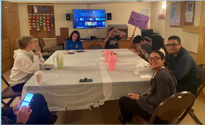
Snacking and socializing.