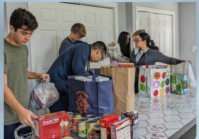
Unloading the food donations.