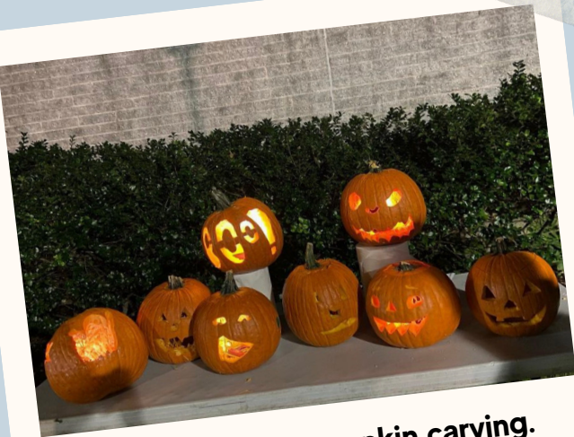
Last October's pumpkin carving.