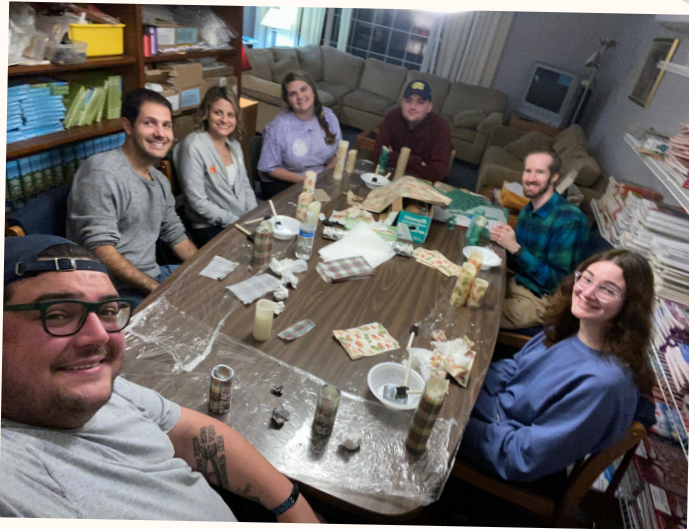
Our last meeting on November 4th.