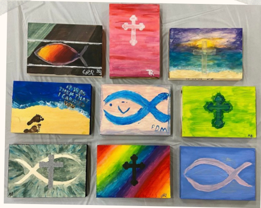
Fish, and cross stencil paintings.