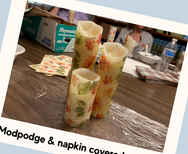
Modpodge & napkin covered candles.

Message stm_church on Instagram for more info!