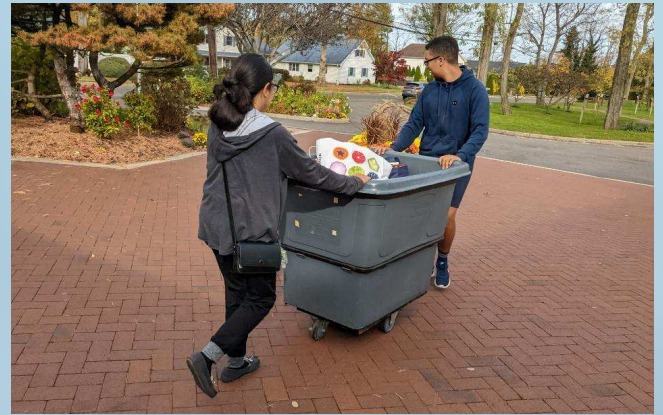
Gathering the donations for Outreach.