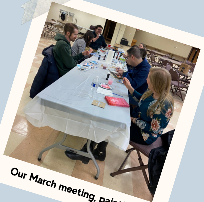
Our March meeting, painting.

We typically meet once a month! We have deep discussions about our faith, do fun crafts, and much more!