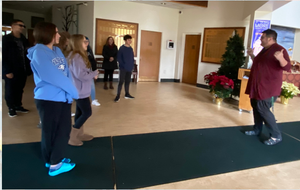
Tour of the Narthex.