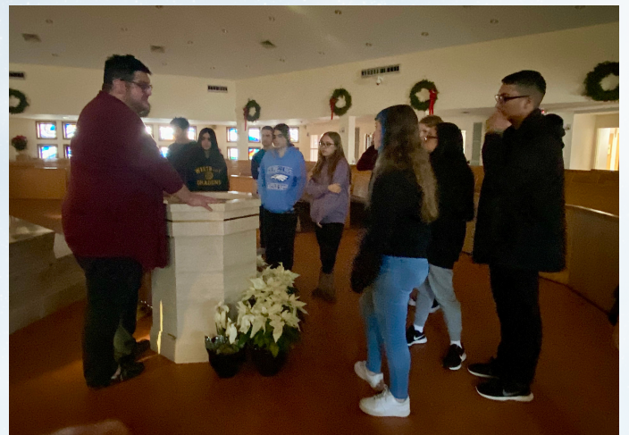
Tour of the altar and baptismal font.