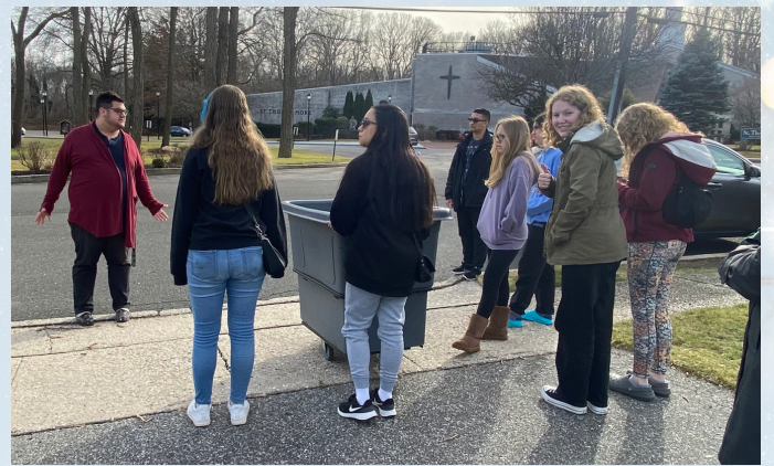
Learning where the Rectory & Religious Ed are.