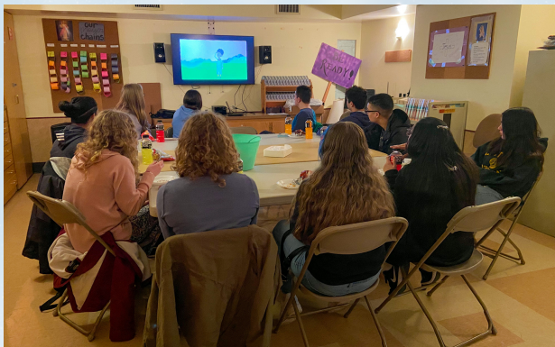
Learning Sunday's readings.