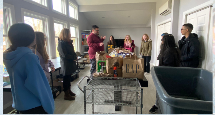
Delivering the Outreach donations.