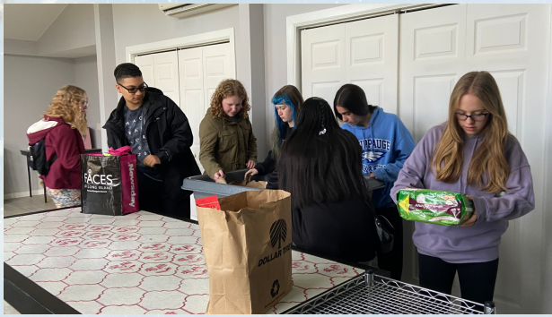
At our Parish Outreach.