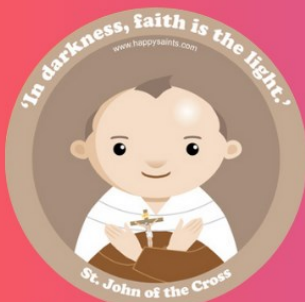
St John of the Cross Feast Day: December 14th Priest, Mystic, Doctor of the Church Patron: Spanish Poets

From a wealthy Roman family, received a vision of St Agatha promising her mother would be healed of illness. Used opportunity to distribute riches to the poor. Her betrothed disagreed and had her sentenced to a brothel. She was martyred in their attempt to take her to her punishment.