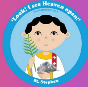
St Stephen Feast Day: 12/26 The First Martyr "The Promartyr" Patron: Altar Servers

Carmelite friar, very involved in the Counter-Reformation in Spain. Studied under and was mentored by Teresa of Avila (St Teresa of Jesus). Prolific writer known for his poetry and writings on the development of the soul. Considered one of the greatest authors of Spanish literature.