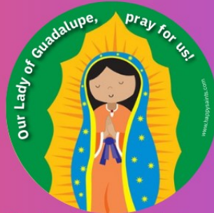
Our Lady of Guadalupe Feast Day: December 12th Empress of the Americas, Patroness of Latin America, Queen of Mexico

Governor and theologian, strong promoter of Roman Christianity against Arianism & paganism. Swarm of bees landed on his face as an infant, leaving him unharmed. Helped convert St Augustine to Christianity. Authored four hymns known as the Ambrosian hymns.