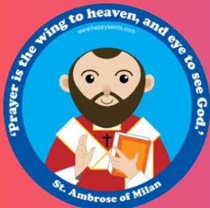
St Ambrose Feast Day: December 7th Bishop of Milan Patron: Beekeepers

Governor and theologian, strong promoter of Roman Christianity against Arianism & paganism. Swarm of bees landed on his face as an infant, leaving him unharmed. Helped convert St Augustine to Christianity. Authored four hymns known as the Ambrosian hymns.