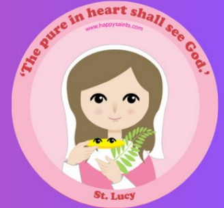
St Lucy Feast Day: December 13th Virgin & Martyr Patron: The Blind

¿No estoy yo aquí que soy tu madre? Am I not here, I who am your mother?