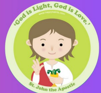
St John the Apostle Feast Day: December 27th Apostle Patron: Love, loyalty

Mentioned in Acts of the Apostles (Acts 6), he was a deacon in the early Church in Jerusalem. Angered members of various synagogues with his teachings. Accused of blasphemy and was stoned to death.