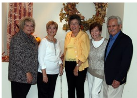
St. Thomas More's RCIA Ministry Team

For those not baptized or baptized in another Christian church, or baptized Catholics who have never received First Communion or Confirmation, and are interested in the process, please call the rectory at 234-5551. Have you or anyone you know had that little persistent feeling that you want to be a practicing member of the St. Thomas More Community? God might be inviting you to inquire about the Catholic Church through the RCIA process.