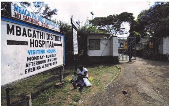
The Mbagathi District Hospital is the closest public hospital to Kibera, Nairobi's largest urban slum.