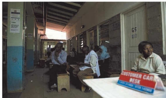
The Mbagathi District Hospital is equipped to handle 300 births per month but actually handles 2,000 births per month, forcing women to leave the hospital just 12 hours or less after giving birth.