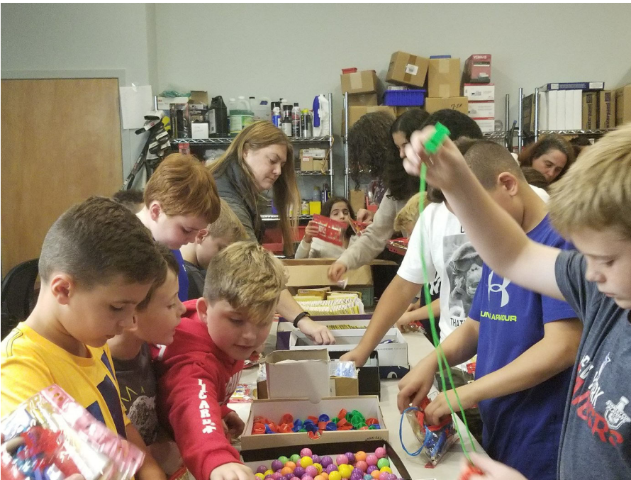
Christmas Child Project - continued