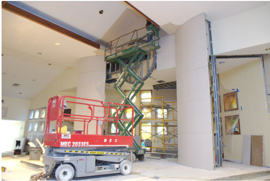
Progress Photos of our Church Renovation Project.