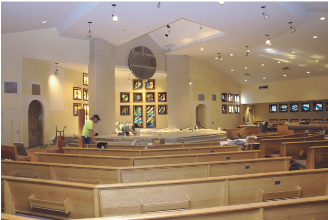
Progress Left Side